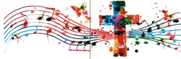
Celebrating Pete Byrd's 100th Birthday...