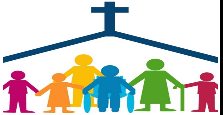
Easter Joy at Cradock Baptist Church...